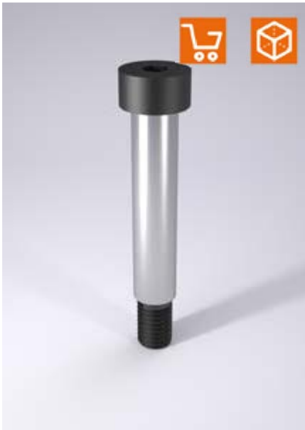
Exemple de montage