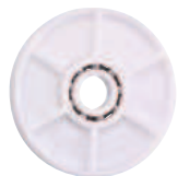
PA cage, stainless steel balls