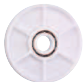
PA cage, glass balls